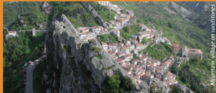
Mountain village on sandstones